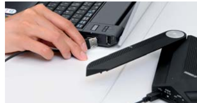
Compact, lightweight. With USB power, simply connect to a PC to use.