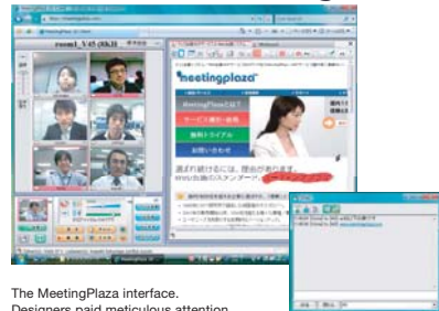
The MeetingPlaza interface. Designers paid meticulous attention to detail to make this very easy to use.