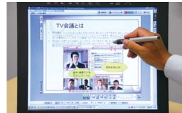
Get people's attention and improve persuasiveness by writing on screen with StarBoard.