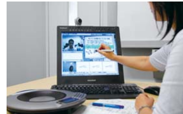
The PJP-50R and StarBoard support smooth conferencing.