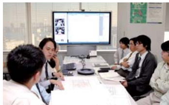
The affordable PJP-50R is an essential tool for conferences with small numbers of participants.

Shimizu Corp. has adopted the PJP-50R as the microphone speaker for conferences at individual locations. The reasonably-priced PJP-50R comes with three connectors. The first is the "audio I/O port" used to connect the unit to a PC for use as a Web conference microphone speaker. The second is the "LAN port" for IP connections, and the third is the "LINE terminal" for connecting analog phone lines. Moreover, the unit has a built-in audio mixer that allows all connectors to be used simultaneously. Therefore it supports a very wide range of conferencing formats, accepting participants via IP phone, analog phone, cell phone, land line, and other sources. The PJP series will continue to support the various kinds of corporate communication being conducted at Shimizu Corporation.