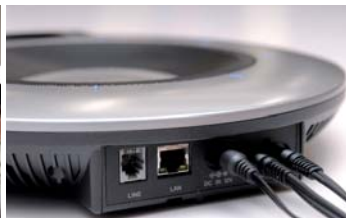
The PJP-50R's various connectors