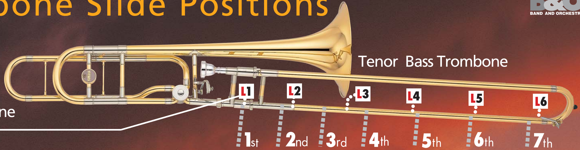
Tenor Bass Trombone